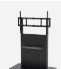
Mobile Stand (ST23C)