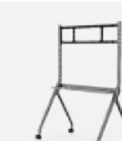
Mobile Stand (ST41B)