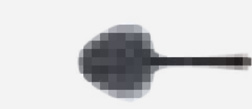
Wireless Dongle (WT13)